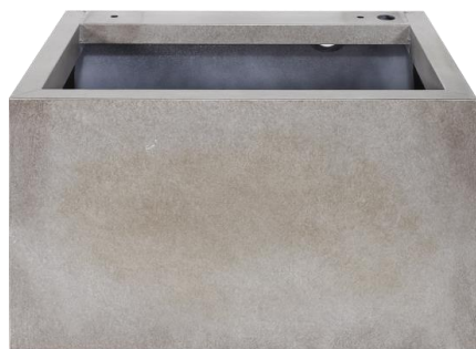
Fountain Base 1x