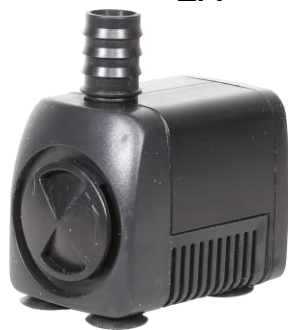
Fountain Pump 1x

*Pump may be packaged separately in an outer box located in the outer Styrofoam packaging.