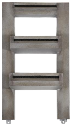
Fountain Top 1x