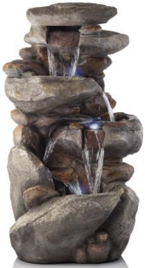
Fountain (3 LED lights pre-installed) 1x