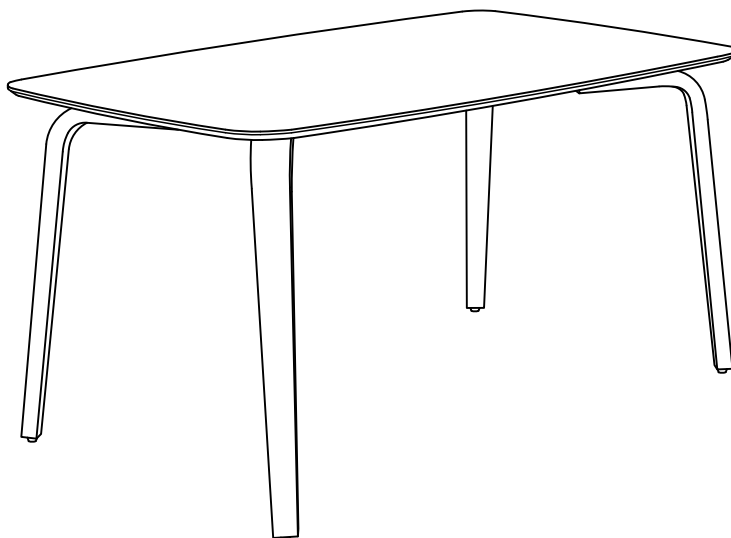
COMPLETED TABLE ASSEMBLY.