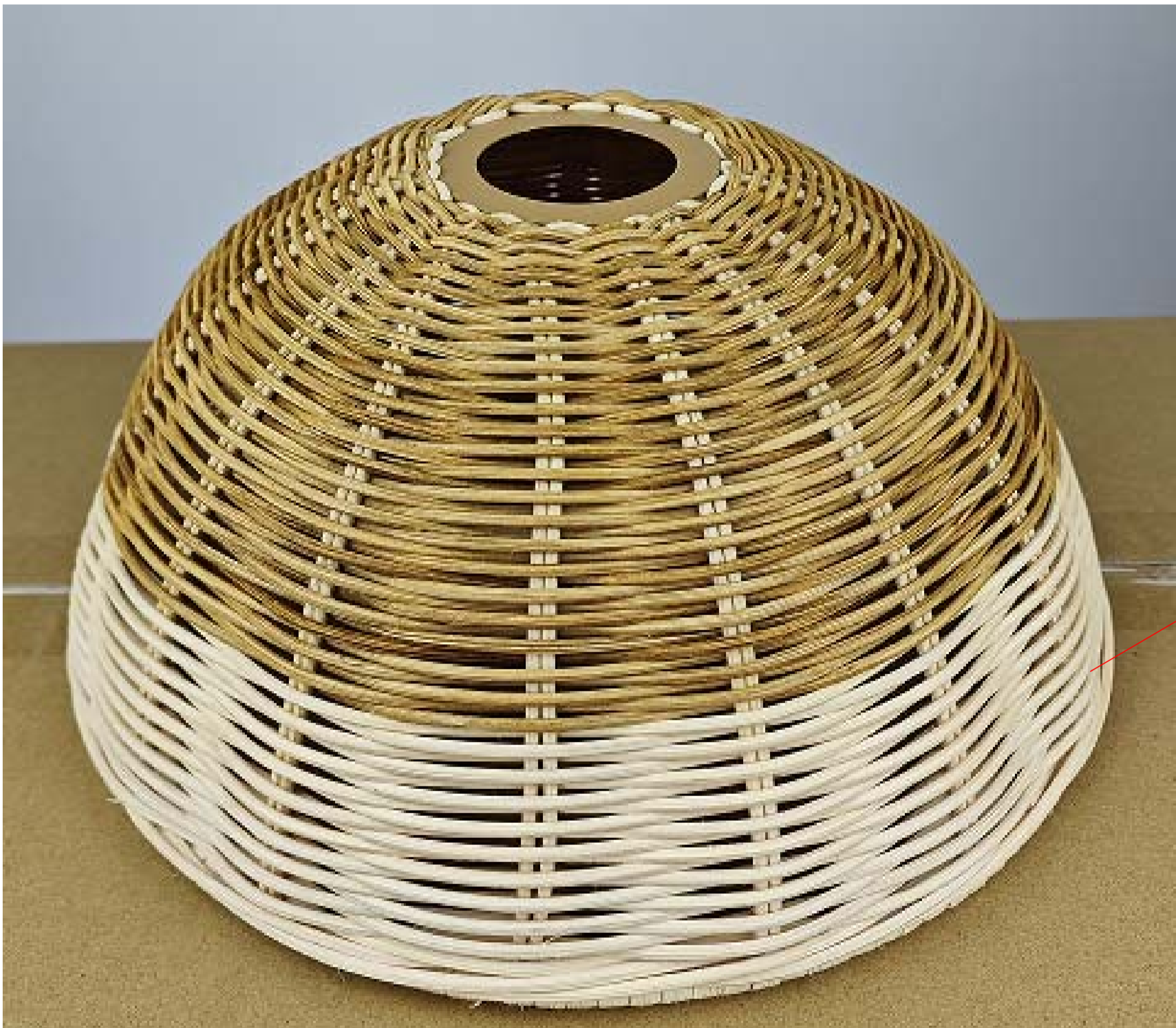
LAMPSHADE SURFACE EFFECT REFERENCE PICTURE

DESIGN COPYRIGHT – 10/25/2024 ALL RIGHTS RESERVED AND MAY NOT BE DUPLICATED WITHOUT OUR WRITTEN PERMISSION