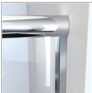
Shower Door Wall Profile