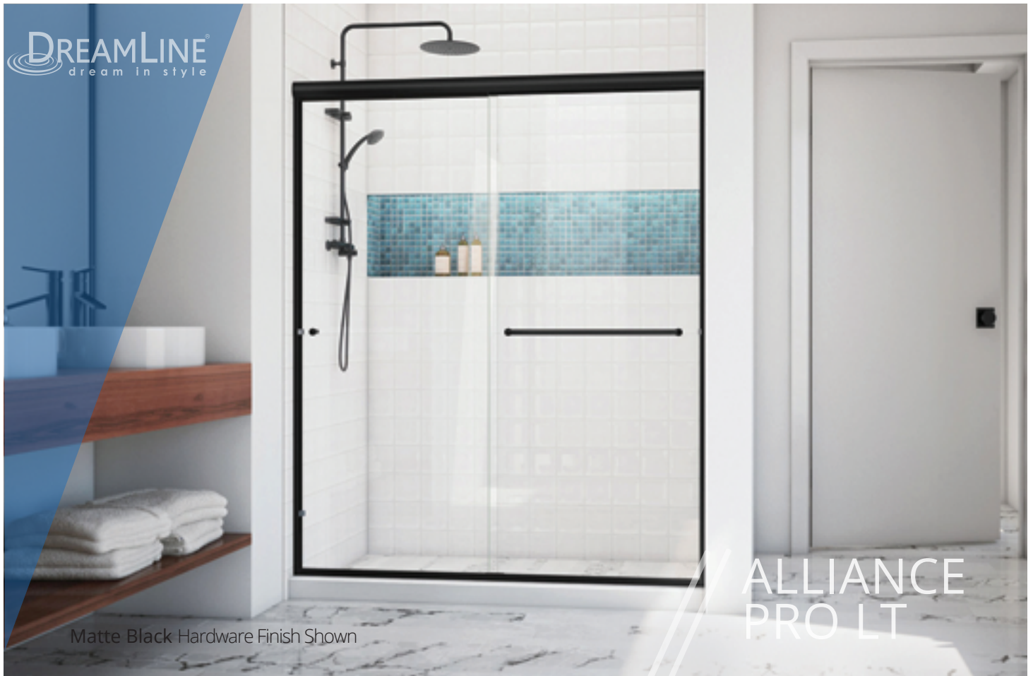
Matte Black Hardware Finish Shown