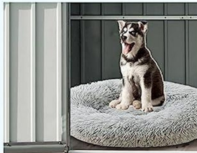
As Pet House