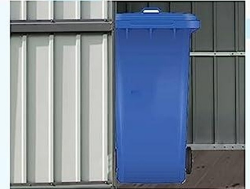
As Garbage Chamber