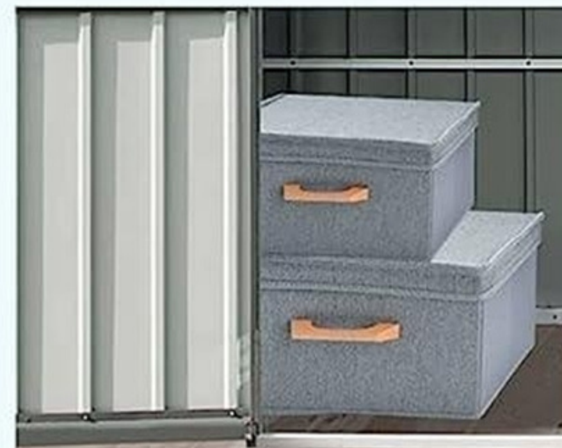
As Store Room