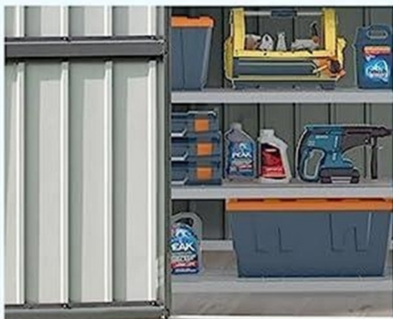
As Tool Storage Shed