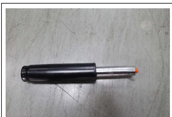
Sample as received - View 1