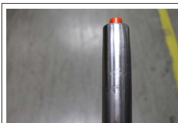
Sample as received - View 2

SGS authenticate the photo on original report only