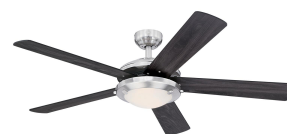
Reversible Wengue Finish Blades