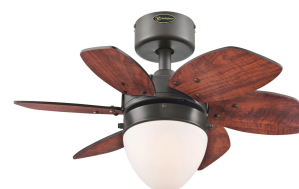
Reversible Applewood Finish Blades