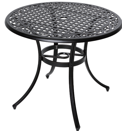
Cast Aluminum Round Dining Table CT002A SKU:CT002A