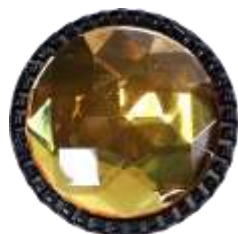
Jewel Nut x1